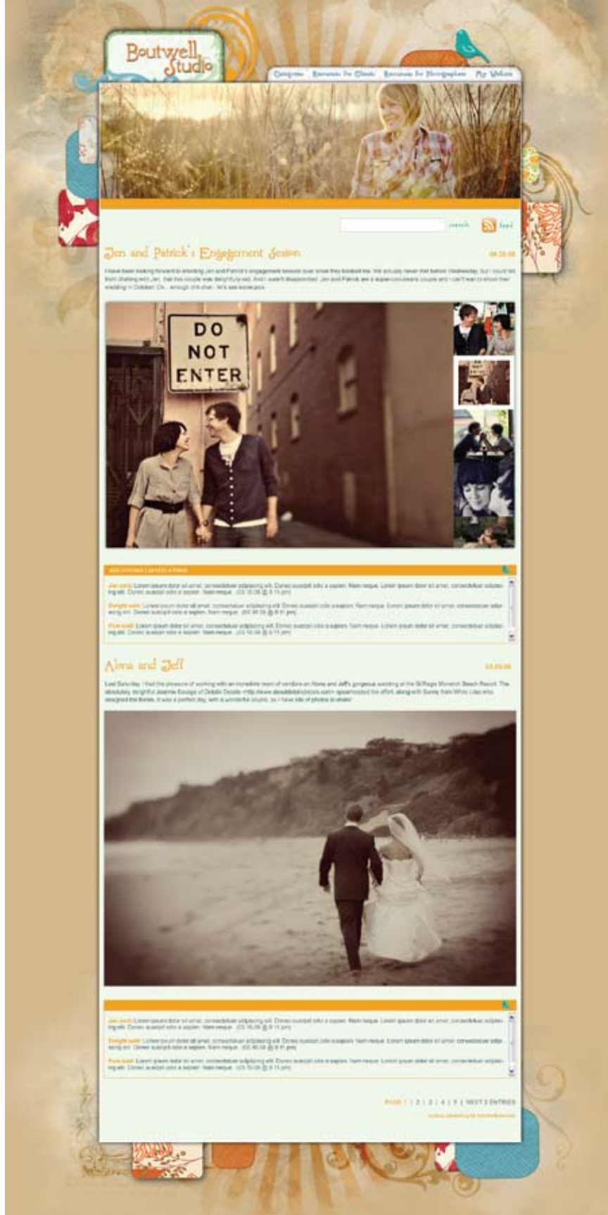
Above: Into The Darkroom created this custom blog for Boutwell Studio. It features rich colors and textures, and a custom Flash blog show that saves bandwidth, space and creates interactivity.